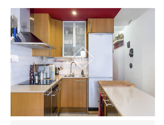
lucasfox.com/go/bcn4534 Communal terrace, Transport nearby, To renovate, Exterior, Balcony

A bright, attractive 2-bedroom property in the fashionable Born area of Barcelona.