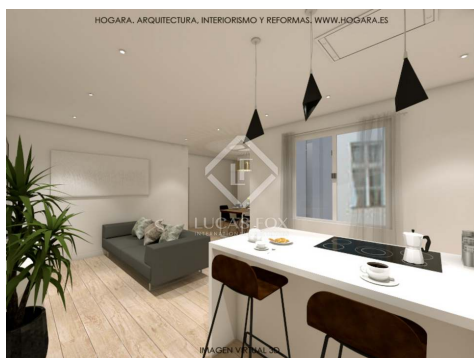
IMAGEN VIRTUAL 3D