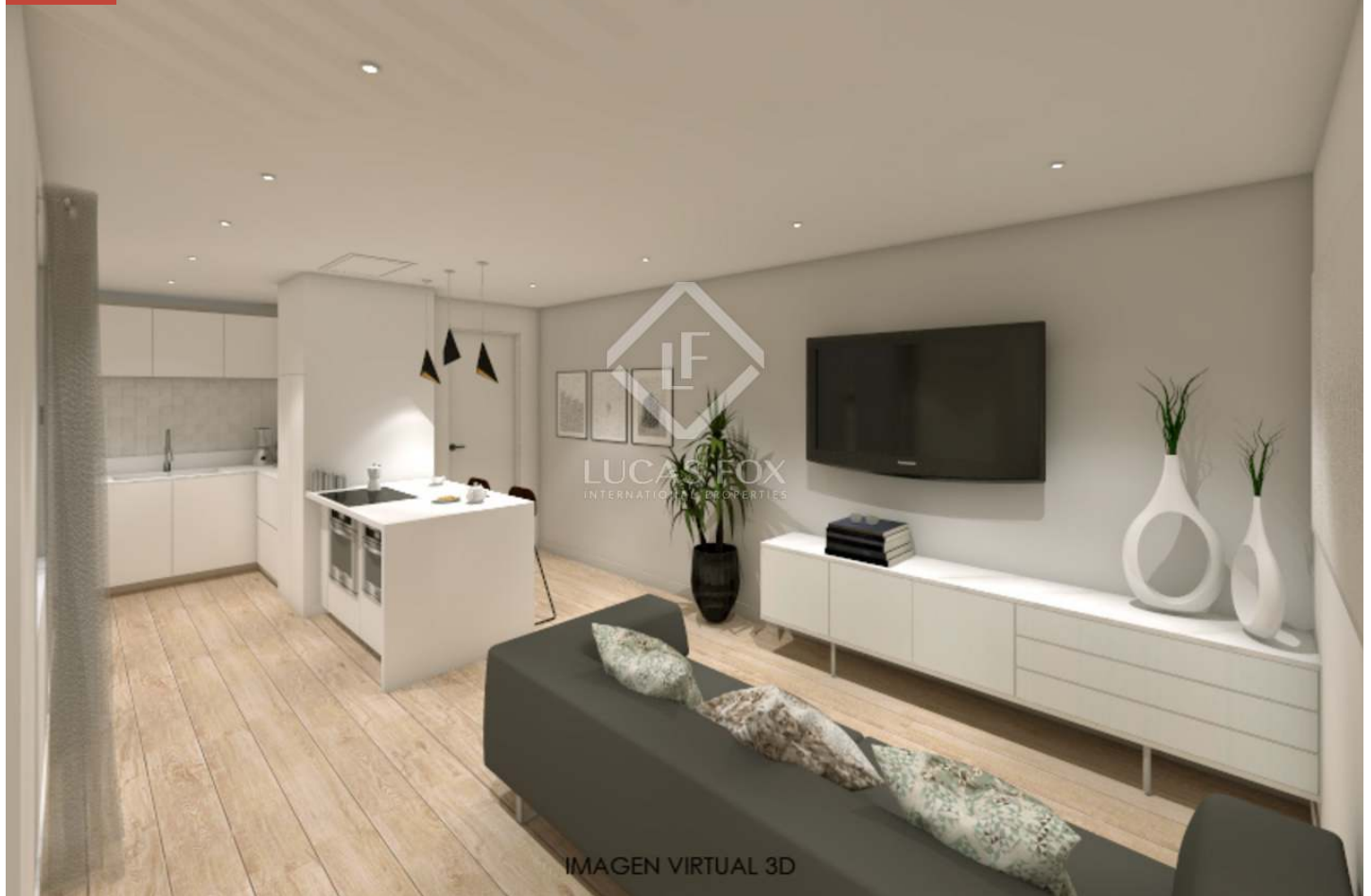
IMAGEN VIRTUAL 3D