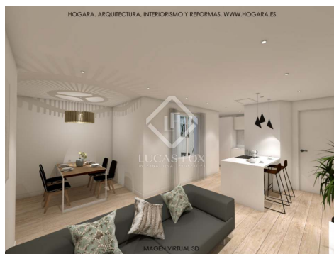
IMAGEN VIRTUAL 3D