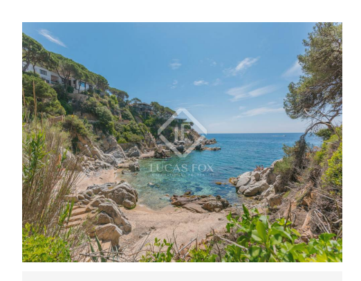
lucasfox.com/go/cbr2951 Waterfront, Sea views, Terrace, Swimming Pool, Garden, Parking, Views, Heating, Barbecue, Alarm, Air conditioning

The property has a flat front garden with views of the sea which is within walking distance and the peaceful surroundings of pine forests. A wonderfully tranquil, picturesque place for a family residence of holiday home by the sea. The house is very close to Cala Trons, one of the prettiest beaches on the Costa Brava. What's more, the Montgoda residential area offers residents communal facilities such as a swimming pool and tennis courts. Private parking is provided for 2 cars.