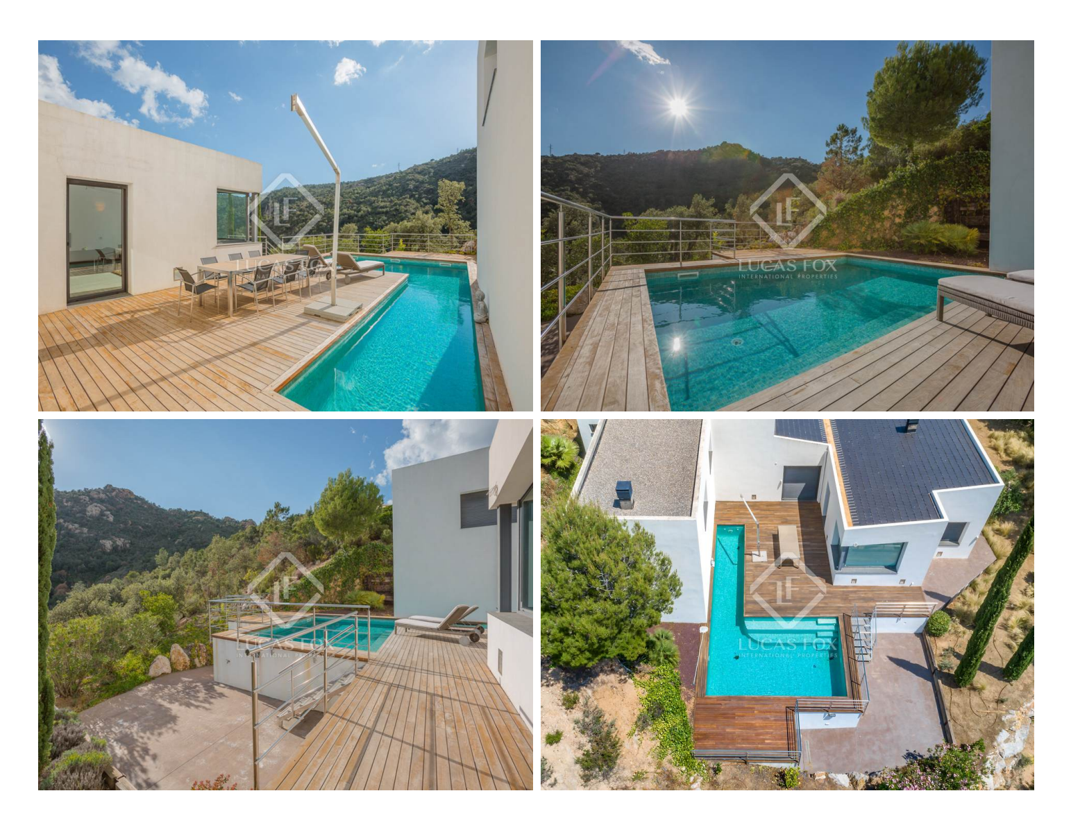
Important Information relating to properties offered by Lucas Fox. Any property particulars are not an offer or contract, nor part of one. You should not rely on statements by Lucas Fox in the particulars or by word of mouth or in writing as being factually accurate about the property, its condition or its value. Neither Lucas Fox nor any associated agent has any authority to make any representations about the property, and accordingly any information given is entirely without responsibility on the part of the agents, seller(s) or lessor(s). Prior the signature of any document concerning the property we recommend that all purchasers consult an independent lawyer and if necessary carry out a survey of the property to ascertain condition / measurements. Areas, measurements and distances given are approximate only and should be checked by the purchaser.