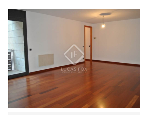
lucasfox.com/go/lfa183 Terrace, Lift, Parking

The property offers a master ensuite bedroom, 2 double bedrooms, a further complete bathroom and a bright and spacious living/dining room with a fireplace.