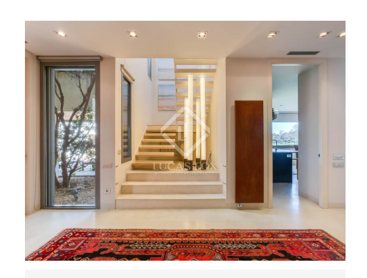
lucasfox.com/go/lfcb956 Terrace, Swimming Pool, Garden, Parking

There is a caretaker's apartment at the entrance with a kitchenette, a living room and an ensuite bedroom. Next to this there is a covered garage for 4 cars that is reached via electric gates on the side of the property, and machine rooms that house the decalcifying machine and boilers.