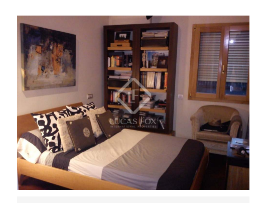
lucasfox.com/go/lfmr1078 Garden, Swimming pool, Terrace, Parking Minimum Rental Period: 12 Months.

The ground floor has undergone a very recent renovation, offering a second, more intimate, family living space, with a bathroom, a storage/workshop room and an ensuite service bedroom.