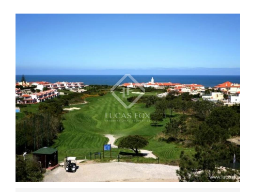
lucasfox.com/go/lfp207 Sea views, Terrace, Swimming Pool, Garden, Parking

There is a generously sized kitchen fully fitted with best quality appliances and with ample storage space. There is also a guest toilet, a utility area and acess to the garage. The golf villa has a master suite with fitted wardrobes a scond suite and two further double bedrooms and a family bathroom.