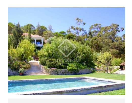
lucasfox.com/go/lfp405 Terrace, Swimming Pool, Garden, Parking

The house is set within four hectares of land which is a mixture of landscaped gardens and woodland. There are a great variety of trees, plants and shrubs which all enhance the landscape of this secluded estate. There is also a wonderful swimming pool which as uninterrupted views of the Serra and has adjacent shower and toilet facilities.