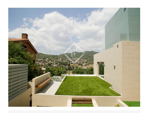
lucasfox.com/go/lfs6026 Terrace, Swimming Pool, Garden, Lift, Parking

The upper floor offers beautiful views of the Collserola park and includes a spa wellness area with sauna, jacuzzi, a swimming pool and a bar. It also has a magnificent lawn garden.