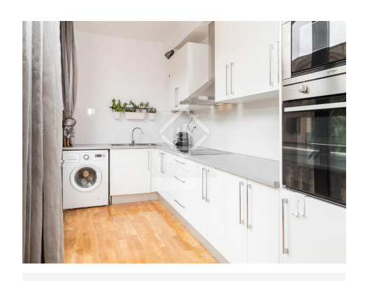
lucasfox.com/go/lfs7219a Lift, Natural light, High ceilings, Parking, Renovated, Heating, Exterior, Air conditioning

The open kitchen is fully equipped, functional and bright, completing the daytime living space. In the sleeping quarters we find 2 large double bedrooms with fitted wardrobes and a complete bathroom.