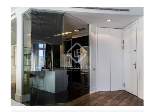
lucasfox.com/go/lfv1179 Lift, Wooden flooring, Natural light, Heating, Air conditioning

On entering the property you will find a wonderful living room with 4 large windows, high ceilings and ornamental mouldings. The independent kitchen is separated from the living area by a glass wall, providing a great sense of space.