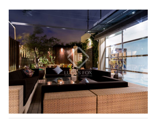
lucasfox.com/go/lfv1236 Terrace, Swimming Pool, Garden, Lift, Parking

A unique, one-of-a-kind property situated in the heart of the city.