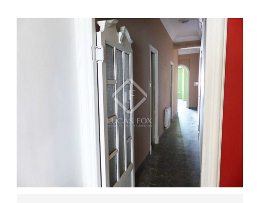
lucasfox.com/go/lfv1382 Lift, Natural light, To renovate

If currently has 5 bedrooms and 2 bathrooms and offers huge potential to be converted into a fantastic property.