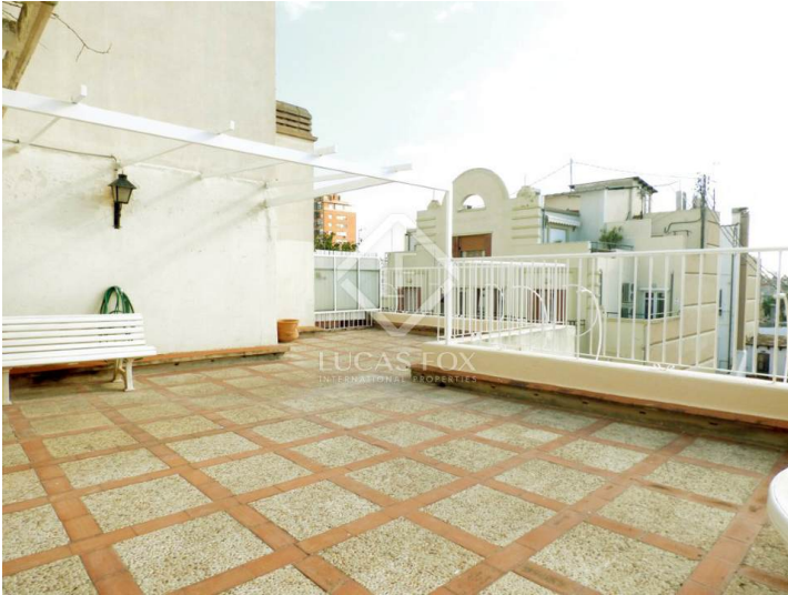
PROPUESTA ATICO DUPLEX