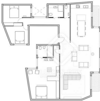
PLANO ESTADO PROPUESTA 01

Important Information relating to properties offered by Lucas Fox. Any property particulars are not an offer or contract, nor part of one. You should not rely on statements by Lucas Fox in the particulars or by word of mouth or in writing as being factually accurate about the property, its condition or its value. Neither Lucas Fox nor any associated agent has any authority to make any representations about the property, and accordingly any information given is entirely without responsibility on the part of the agents, seller(s) or lessor(s). Prior the signature of any document concerning the property we recommend that all purchasers consult an independent lawyer and if necessary carry out a survey of the property to ascertain condition / measurements. Areas, measurements and distances given are approximate only and should be checked by the purchaser.