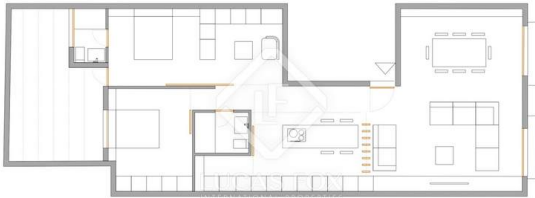
PLANO DE PROYECTO

Important Information relating to properties offered by Lucas Fox. Any property particulars are not an offer or contract, nor part of one. You should not rely on statements by Lucas Fox in the particulars or by word of mouth or in writing as being factually accurate about the property, its condition or its value. Neither Lucas Fox nor any associated agent has any authority to make any representations about the property, and accordingly any information given is entirely without responsibility on the part of the agents, seller(s) or lessor(s). Prior the signature of any document concerning the property we recommend that all purchasers consult an independent lawyer and if necessary carry out a survey of the property to ascertain condition / measurements. Areas, measurements and distances given are approximate only and should be checked by the purchaser.