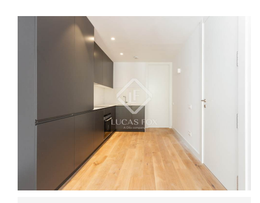
lucasfox.com/go/bcn11880 Interior, Exterior

A perfect opportunity for someone who wants to be in a peaceful space close to all conveniences of central city living.