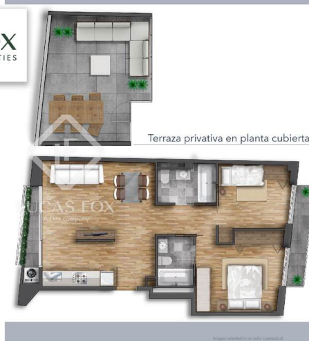
Vivienda 2 - Planta Primera