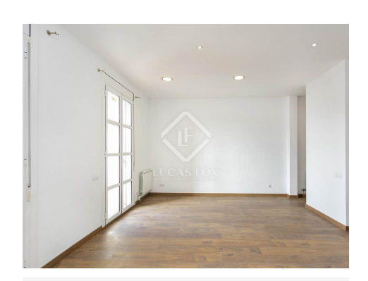
lucasfox.com/go/bcn25240 Terrace, Lift, Wooden flooring, Natural light,

Please contact us for more information or to make an appointment.