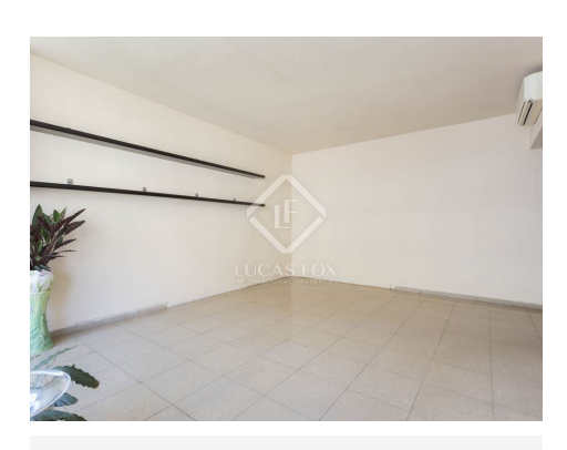
lucasfox.com/go/bcn6619 Concierge service, Lift, Parking, Transport nearby, To renovate, Service lift, Near international schools, Heating

A peaceful apartment to renovate completely in a great location near Turo Park. Ideal for families.