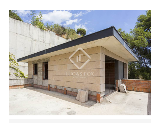
lucasfox.com/go/bcn7179 Terrace, Garden, Parking

A great opportunity to personalise a family villa in an excellent location with easy access to and from the city.