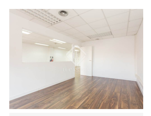
lucasfox.com/go/bcn7373 Concierge service, Lift, To renovate, Heating, Air conditioning

The building, which dates back to 1967, has a concierge service and is very peaceful. Its location close to Via Augusta, Plaza Gal.la Placidia and Plaza Molina make this a really exciting renovation opportunity.