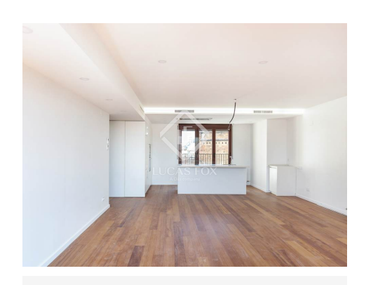
lucasfox.com/go/bcn7549 Terrace, Lift, Natural light, Views, Utility room, Transport nearby, Renovated, Heating, Air conditioning

An impeccably renovated 3-bedroom home with an excellent terrace in the Golden Square area of Eixample, Barcelona.