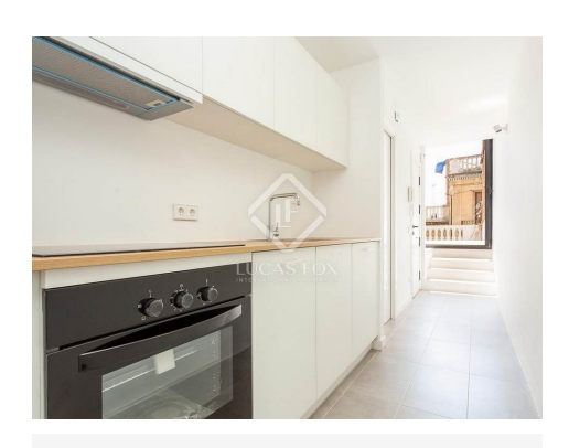
lucasfox.com/go/bcn9267 Terrace, Renovated, Interior, Exterior

An ideal, newly renovated lifestyle property or pied-a-terre for a couple or single professional.