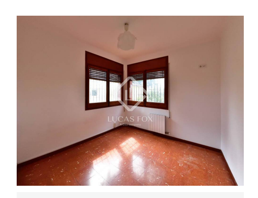
lucasfox.com/go/gav10320 Sea views, Garden, Heating, Air conditioning

Ideal for a family looking to personally design their own home or for an investor that sees the potential in this extendable, well located property.