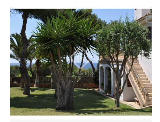
lucasfox.com/go/lfma488 Waterfront, Sea views, Terrace, Swimming Pool, Garden

It is situated on a 1.622m2 plot which includes lawn garden, pool, BBQ area, outdoor toilet as well as open & covered terraces.