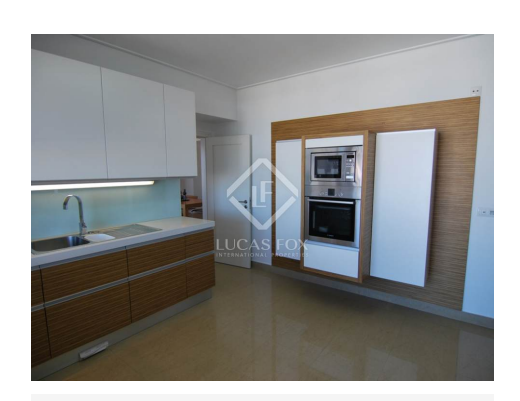
lucasfox.com/go/lfp1113 Terrace, Lift, Parking, New build

This first class apartment is offered for sale unfurnished or with an option to include the furniture as shown.