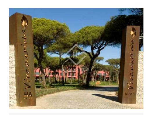
lucasfox.com/go/lfp222 Terrace, Swimming Pool, Garden, Lift,

The apartment consists of four double bedrooms, two of which are ensuite and there is a further family bathroom. All the bedrooms have direct access into the private gardens and have fitted wardrobes. The apartment has parkign for four cars and a lockable storage area.