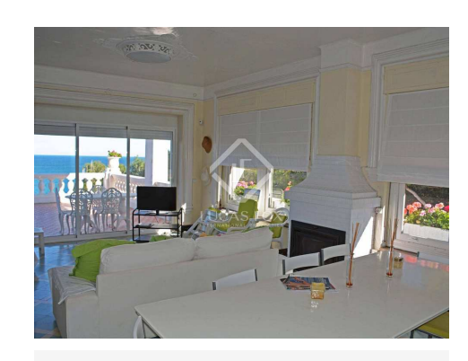
lucasfox.com/go/lfv1115 Sea views, Terrace, Swimming Pool, Garden, Parking

It is the perfect home for enjoying those wonderful, unforgettable summer days and beautiful fresh evenings.