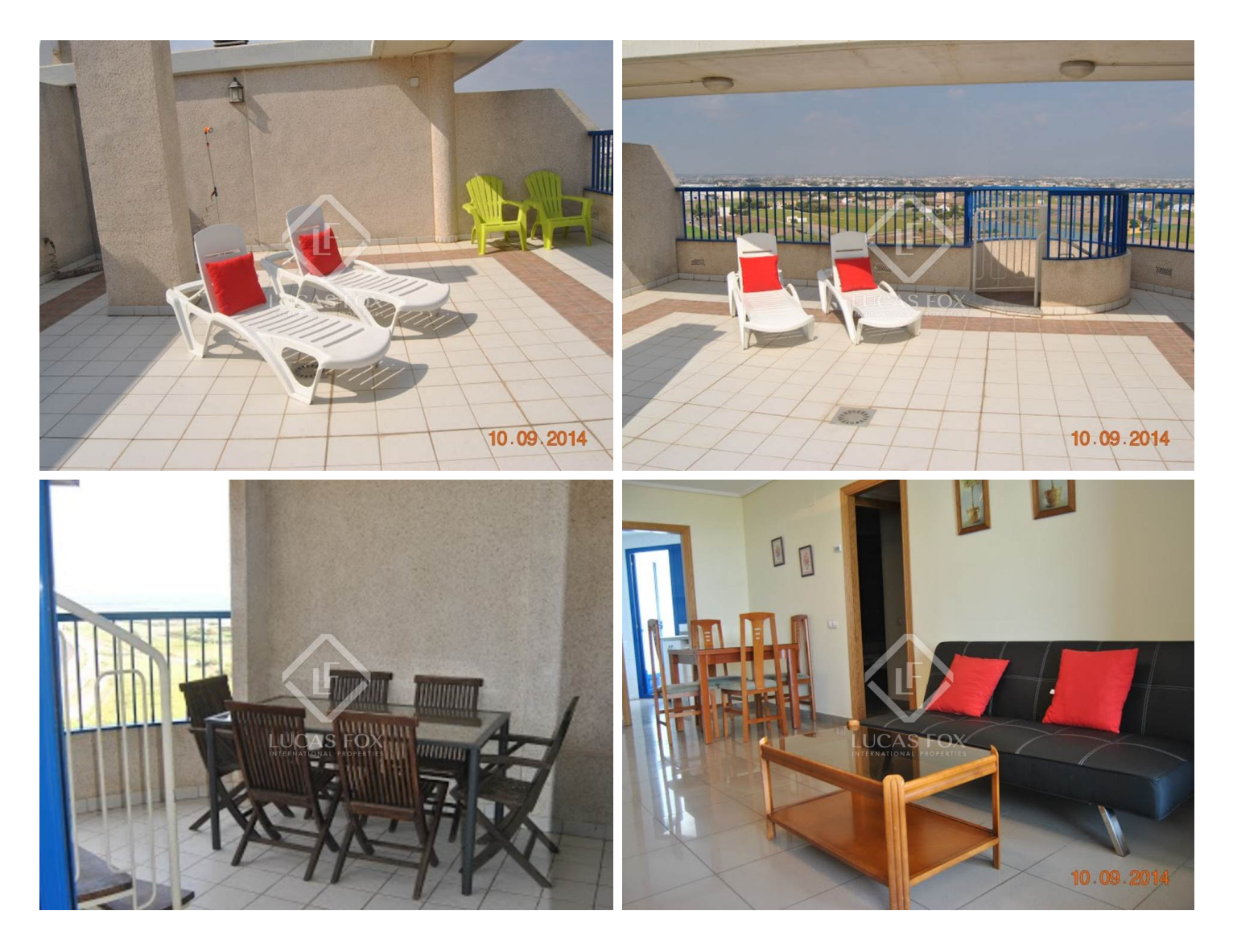
Important Information relating to properties offered by Lucas Fox. Any property particulars are not an offer or contract, nor part of one. You should not rely on statements by Lucas Fox in the particulars or by word of mouth or in writing as being factually accurate about the property, its condition or its value. Neither Lucas Fox nor any associated agent has any authority to make any representations about the property, and accordingly any information given is entirely without responsibility on the part of the agents, seller(s) or lessor(s). Prior the signature of any document concerning the property we recommend that all purchasers consult an independent lawyer and if necessary carry out a survey of the property to ascertain condition / measurements. Areas, measurements and distances given are approximate only and should be checked by the purchaser.