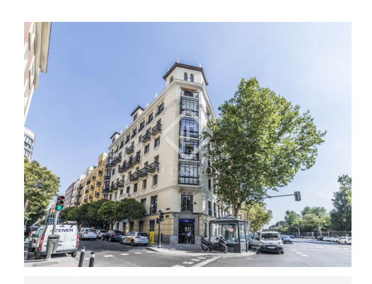
lucasfox.com/go/mad11986 Period Building, Natural light, Transport nearby, Heating, Balcony, Air conditioning

An ideal city centre home for those seeking a property in a strategic location, perfect for enjoying life in the Spanish capital to the full.