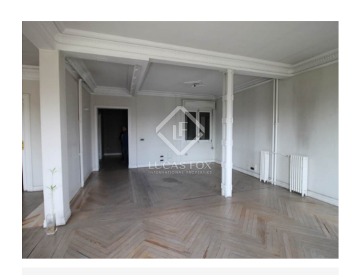
lucasfox.com/go/mad9998 Wooden flooring, Period Building, Natural light, Views, Transport nearby, Storage room, Heating, Exterior, Balcony

A charming, spacious property with enormous renovation potential and highly privileged views of Retiro Park.