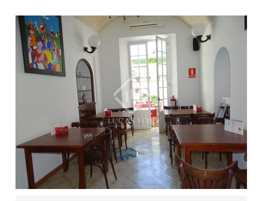
lucasfox.com/go/men13390 Terrace, Heating, Air conditioning

The basement measures 43m², a lovely space with vaulted ceilings. The premises is licensed and has all installations necessary for a successful bar-restaurant, including hot and cold air-conditioning.