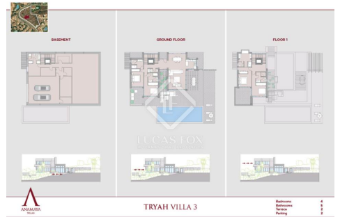
TRYAH VILLA 3

Plot area Built area Terrace Swimming pool