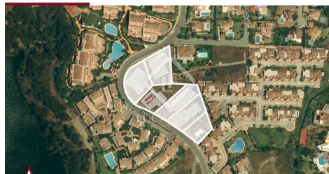
TRYAH VILLA 3 - LOCATION

Plot area Built area Terrace Swimming pool