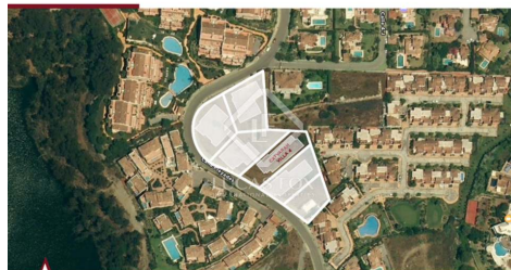
CATVARAH VILLA 4 • LOCATION

1000m 2 Plot 1000m 2 Built 1000m 2 Terrace 1000m 2 Pool 1000m 2 Garage 1000m 2 Security 1000m 2 Greening area