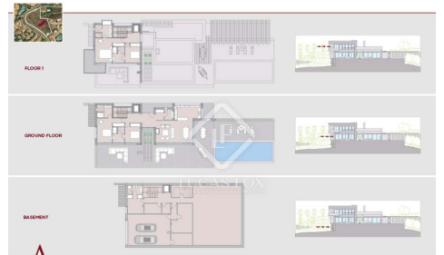
CATVARAH VILLA 4

1000m 2 Plot 1000m 2 Built 1000m 2 Terrace 1000m 2 Pool 1000m 2 Garage 1000m 2 Security 1000m 2 Greening area