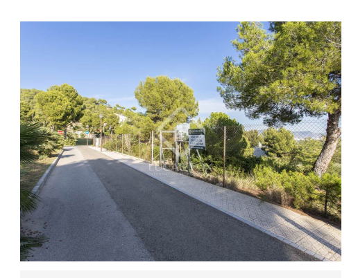
lucasfox.com/go/sit10786 Sea views, Views, Security

The plot boasts beautiful sea views and has permission to build a 2-storey house of approximately 500m<sup>2</sup>, including a basement and annexes, with parking and a swimming pool.