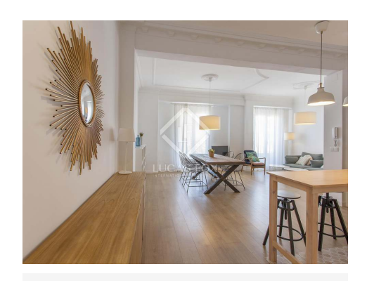
lucasfox.com/go/val24040 Lift, Natural light, High ceilings, Transport nearby, Renovated, Near international schools, Exterior, Equipped Kitchen, Balcony, Air conditioning