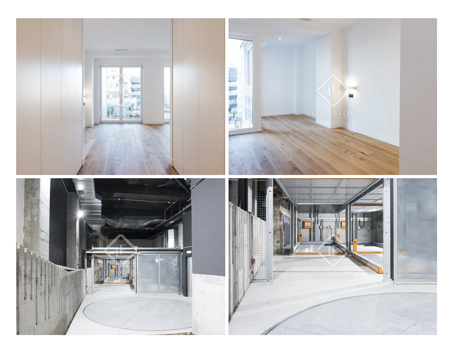
Important Information relating to properties offered by Lucas Fox. Any property particulars are not an offer or contract, nor part of one. You should not rely on statements by Lucas Fox in the particulars or by word of mouth or in writing as being factually accurate about the property, its condition or its value. Neither Lucas Fox nor any associated agent has any authority to make any representations about the property, and accordingly any information given is entirely without responsibility on the part of the agents, seller(s) or lessor(s). Prior the signature of any document concerning the property we recommend that all purchasers consult an independent lawyer and if necessary carry out a survey of the property to ascertain condition / measurements. Areas, measurements and distances given are approximate only and should be checked by the purchaser.