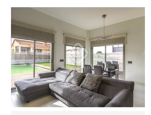
lucasfox.com/go/vilr10515 Minimum Rental Period: 12 Months.

An ideal home for anyone who appreciates clean, minimalist design and modern luxury.