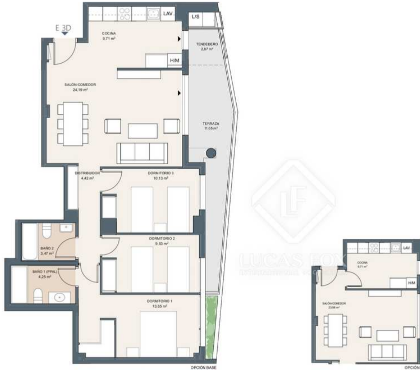
Portal 2. P1-E 3D

3 Bedrooms 2 Bathrooms 106m 2 Floorplan 11m 2 Terrace