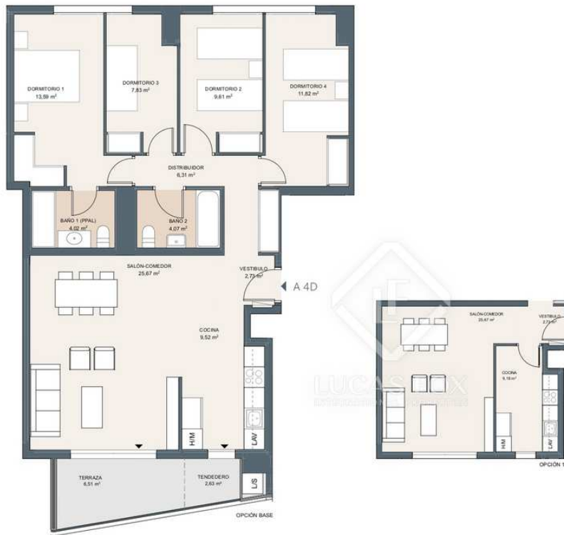
Portal 1. P4-A 4D

4 Bedrooms 2 Bathrooms 124m 2 Floorplan 7m 2 Terrace