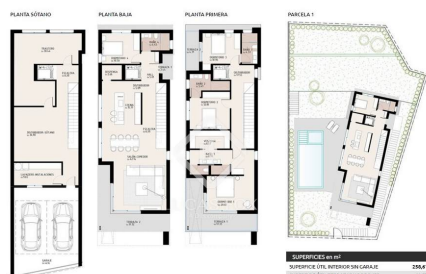
Parcela 1 - Tipología A Vivienda 1A