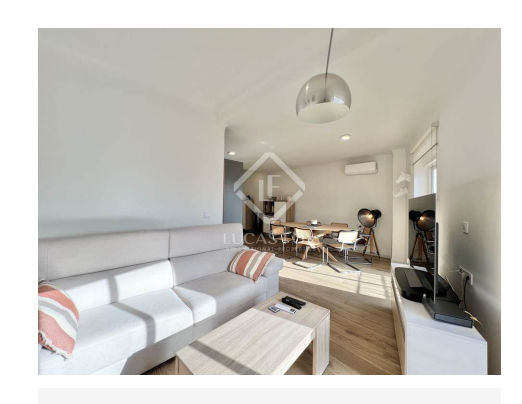
lucasfox.com/go/ali58053 Lift, Natural light, Views, Equipped Kitchen, City views, Balcony, Air conditioning

Ideal for those looking for a place to live or those looking to invest in a high-end property in one of the city's most sought-after areas .