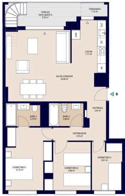
OPCION BASE 1 : 75