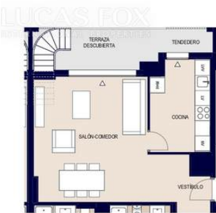
OPCION COCINA CERRADA 1 : 100