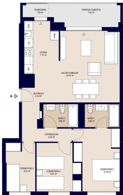
OPCION BASE 1 : 75