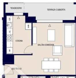
OPCION COCINA CERRADA 1 : 100