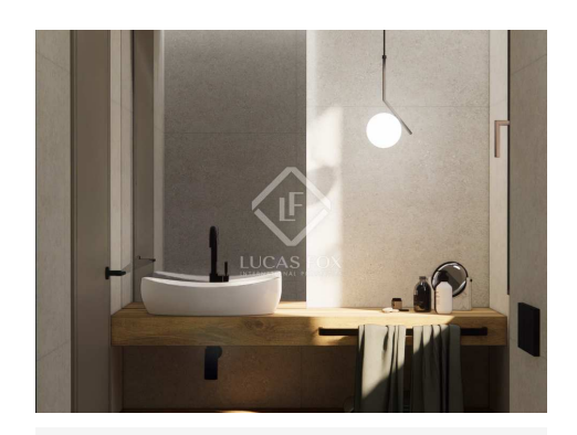
lucasfox.com/go/and44174 Panoramic view

An excellent opportunity to build your dream home in a quiet location close to all services and a few meters walk from the center of Ordino. Contact us today for more information on this parcel.