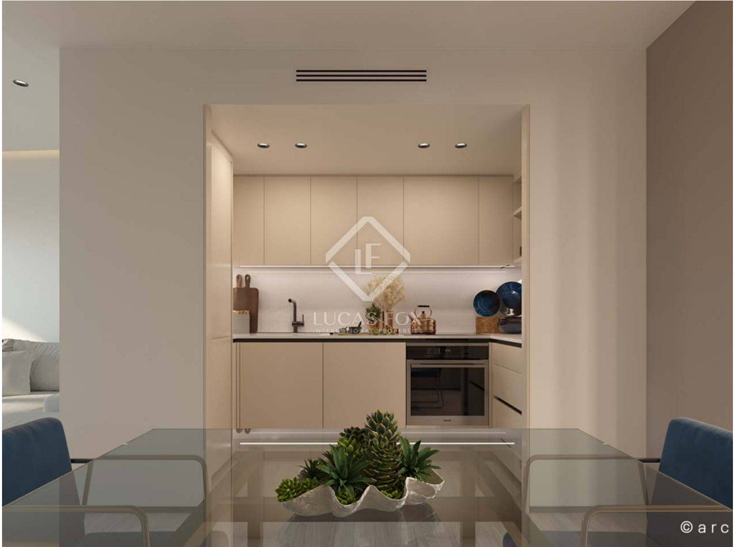
ES - SANT GERVASI RD UNIT - TYPE 3