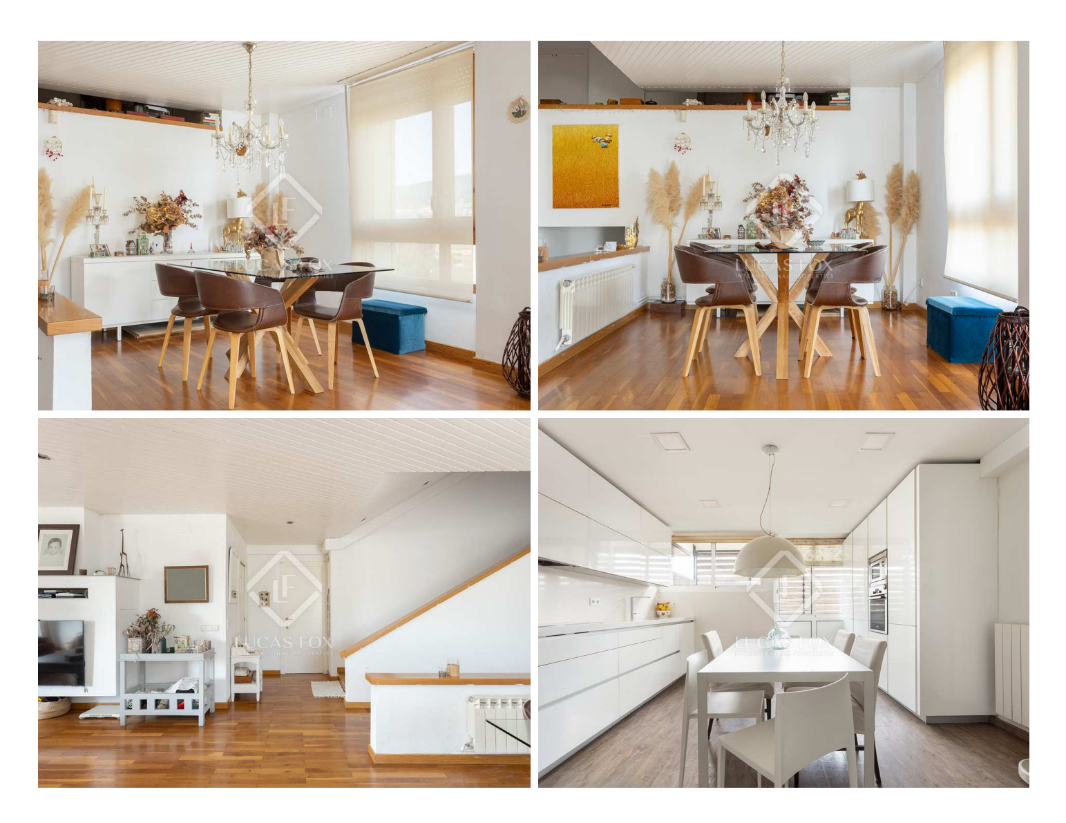
Important Information relating to properties offered by Lucas Fox. Any property particulars are not an offer or contract, nor part of one. You should not rely on statements by Lucas Fox in the particulars or by word of mouth or in writing as being factually accurate about the property, its condition or its value. Neither Lucas Fox nor any associated agent has any authority to make any representations about the property, and accordingly any information given is entirely without responsibility on the part of the agents, seller(s) or lessor(s). Prior the signature of any document concerning the property we recommend that all purchasers consult an independent lawyer and if necessary carry out a survey of the property to ascertain condition / measurements. Areas, measurements and distances given are approximate only and should be checked by the purchaser.