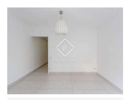
lucasfox.com/go/bcn35660 Lift, Natural light, Exterior, Equipped Kitchen, Built-in wardrobes, Balcony, Air conditioning

Do not miss this opportunity to find an apartment to renovate and customize to your liking in an unbeatable location. Contact us to arrange a visit.